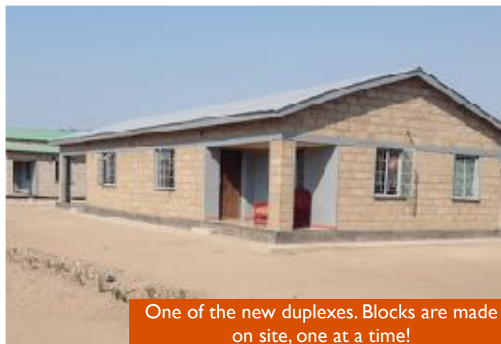
One of the new duplexes. Blocks are made on site, one at a time!