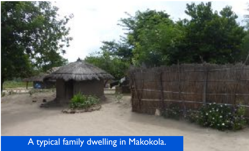
A typical family dwelling in Makokola.

The COVID 19 pandemic has greatly affected the people of Makokola in so many ways. People in the tourism industry have lost their jobs, because the industry is affected with travel restrictions such that most hotels are closed. People now are coping with the culture of wearing masks and washing hands with soap regularly. Most people are struggling to get food for their families due to loss of jobs and losing businesses.