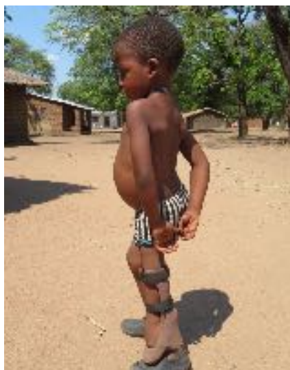
A young boy with a life-altering prosthetic. There are almost 200 children with special needs, which is 6% of the 3,000+ orphans within the MCV catchment area.

Special Needs Program's goals, increasing school attendance for children with special needs or providing life skills to those not in school, is ongoing. Children and young adults with special needs have new opportunities.