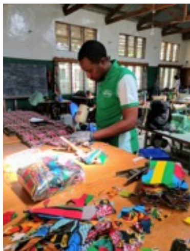
Ayami layout and cutting.