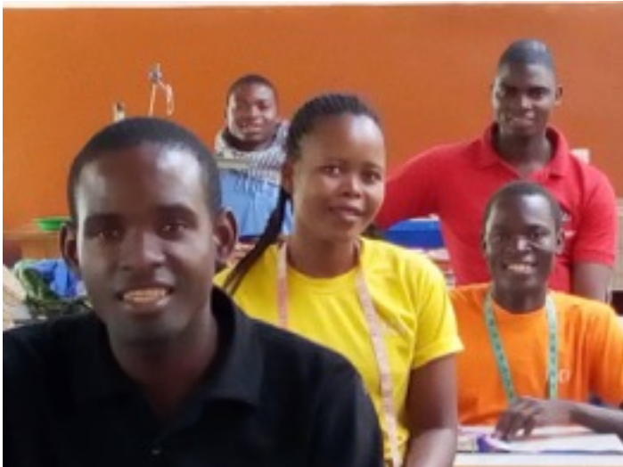
HAPPY FACES: "Zikomo. Thank you for your interest and support of our program!"