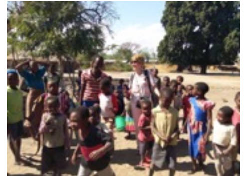
In the village, always an audience.