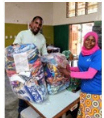
An order ready for delivery.