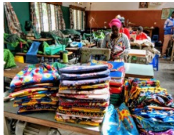
Our handcrafts in production.