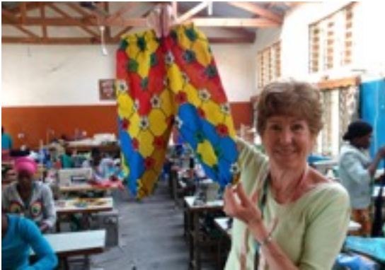
A new design: Baby Happy Pants, become a big seller.