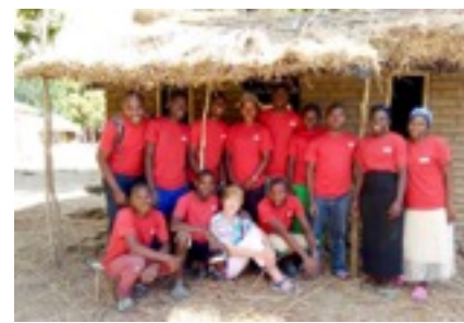
A job well done!