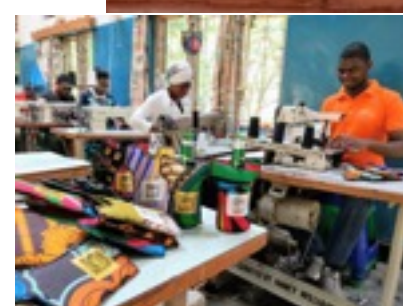
Work for everyone.