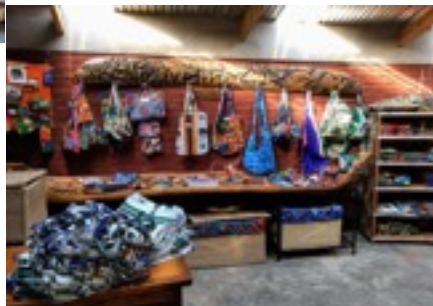
Our retail shop at the program.