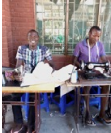
No electricity, we move outside.