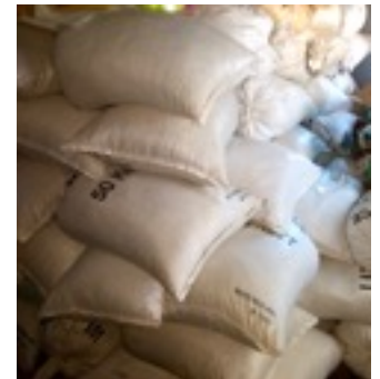
Food security, 123 bags of maize.