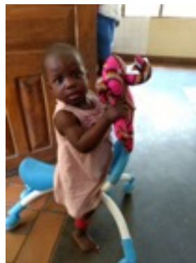
Dolls for the orphanage.