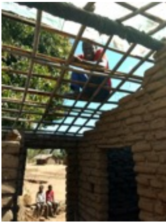
One Saturday we all go to the village to put the roof on Paul's house.