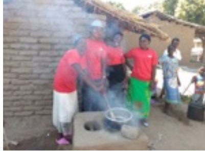
The girls cook a lunch.