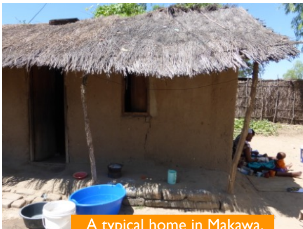
A typical home in Makawa.