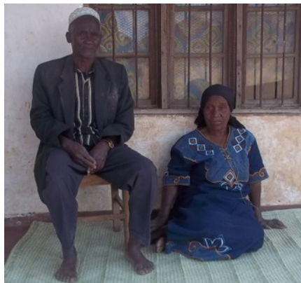
Njereza Village's Chief and his wife. MCV works collaboratively with village headmen to support orphans.