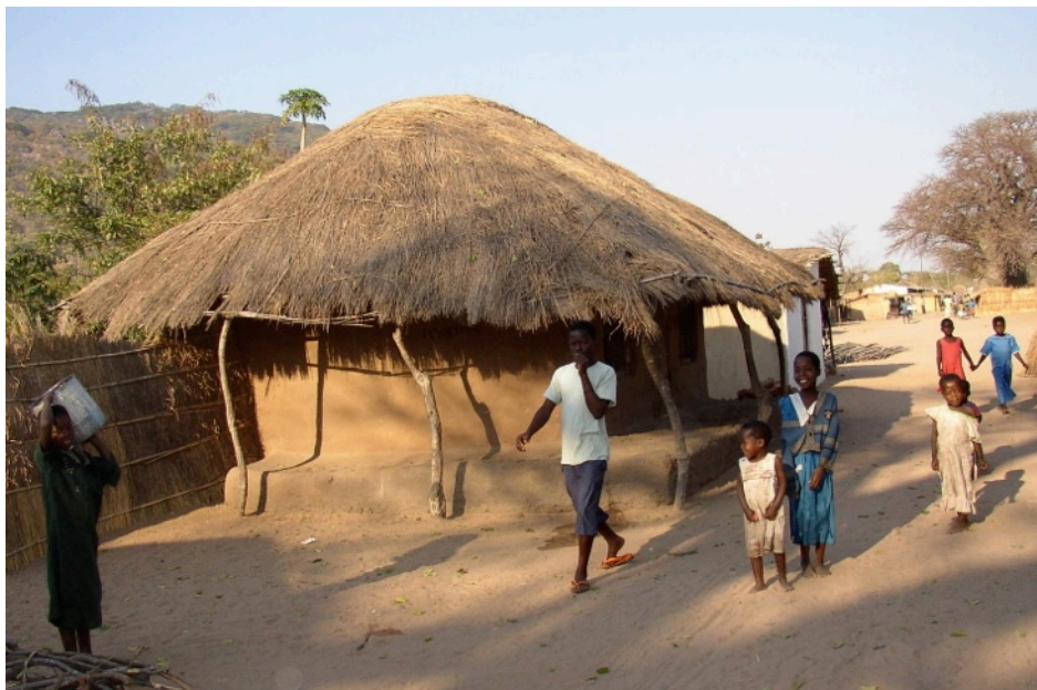
If you are able and willing to give a major level of support to sustain a village such as Njereza, in addition to our heartfelt thanks, you will receive an animal themed certificate acknowledging your gift.

Njobvu (elephant) $2500 level would sustain a larger village