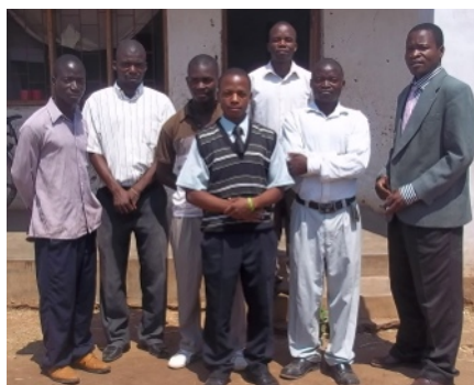
The teachers of Njereza Village's Primary School, where MCV's School-to-School Program has funded the construction of classrooms and offices

Njereza Village is located further from the shore of Lake Malawi than many of the other villages in the MCV catchment area. It is 12 kilometers from the road, over near the hills. Instead of crops being damaged by hippos coming out of the water, here the crops have been damaged by elephants from the hills. (Recently the WWF paid to have the elephants gently removed to a large nature reserve elsewhere.) Most of the people are subsistence farmers, far away from fishing opportunities and far from the commerce available near the main road.