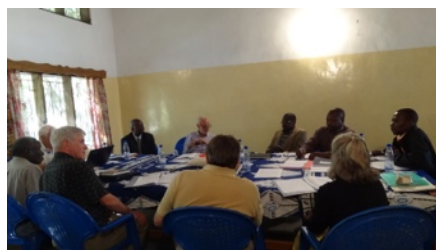
A local project, MCV is overseen by the MCV Malawi Board.