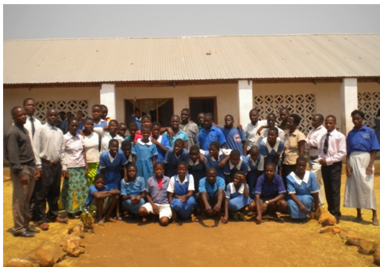
Level eight teachers, students, & MCV Village Volunteer (far right) from Njereza, one of the 37 villages supported by MCV, and the first village in our profile series

Rural Mangochi District, along the southern shores of Lake Malawi, is composed of villages engaged primarily in subsistence farming and fishing. Village populations are family based to a large extent. Up until the mid 1990's any child who lost parents was taken in by extended family, thereby making the concept of "orphan" somewhat rare. But this excellent system of absorbing orphans broke down under the weight of tens of thousands of orphans created by the